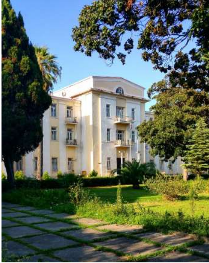
Main office building of UMZ