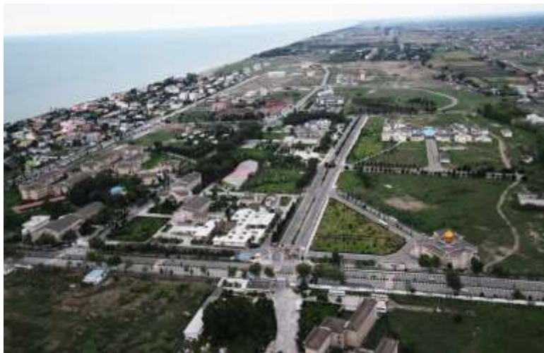
University of Mazandaran